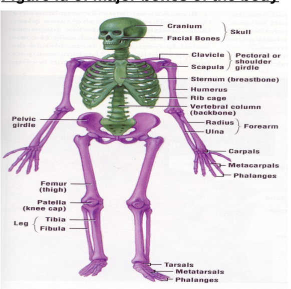
Figure id of major bones of the body